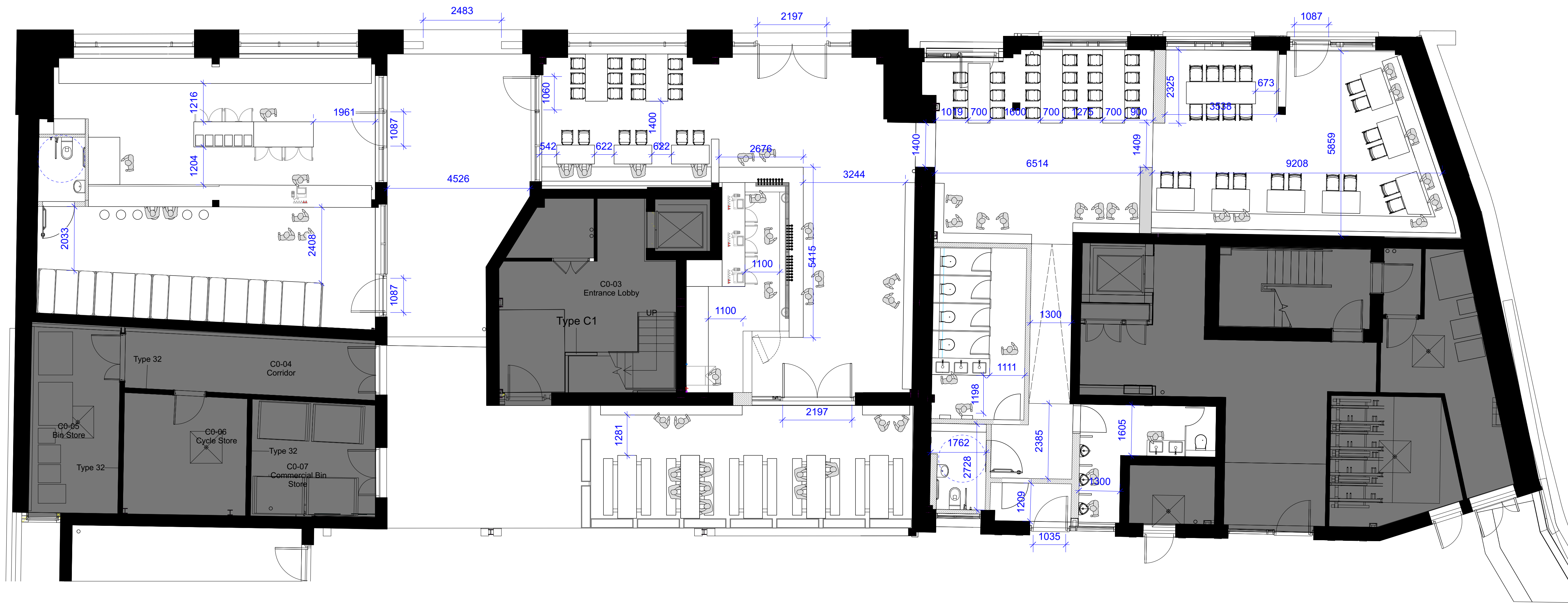
1 GENERAL ARRANGEMENT Scale: 1:75

PLEASE NOTE: ALL DRAWINGS ISSUED BY BURN DESIGN ARE BASED ON THE ORIGINAL ARCHITECT'S DRAWINGS PROVIDED BY THE LANDLORD. THEY DO NOT REFLECT AS BUILT CONDITIONS. THE APPOINTED CONTRACTOR MUST UNDERTAKE FULL SURVEY OF SITE TO ESTABLISH ALL DIMENSIONS AND ENSURE ACCURATE SETTING OUT PRIOR TO CONSTRUCTION.