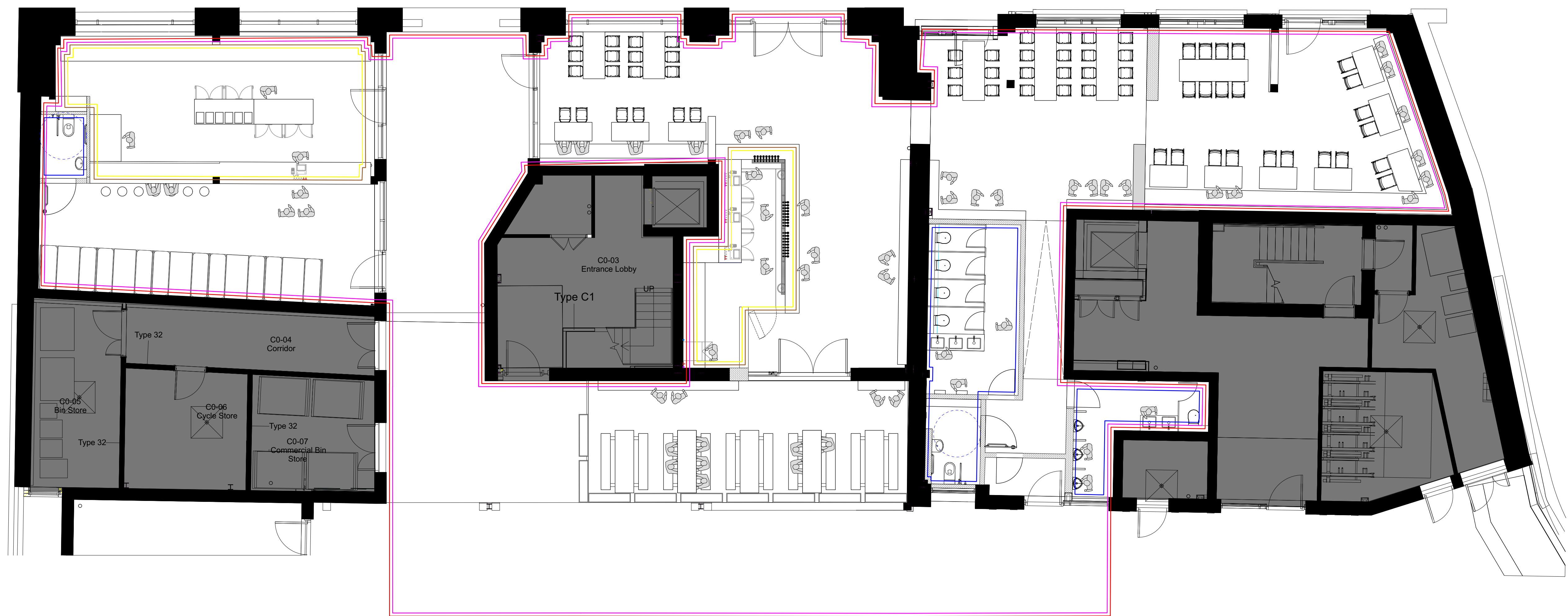
1 LICENCE PLAN Scale: 1:75

PLEASE NOTE: ALL DRAWINGS ISSUED BY BURN DESIGN ARE BASED ON THE ORIGINAL ARCHITECT'S DRAWINGS PROVIDED BY THE LANDLORD. THEY DO NOT REFLECT AS BUILT CONDITIONS. THE APPOINTED CONTRACTOR MUST UNDERTAKE FULL SURVEY OF SITE TO ESTABLISH ALL DIMENSIONS AND ENSURE ACCURATE SETTING OUT PRIOR TO CONSTRUCTION.